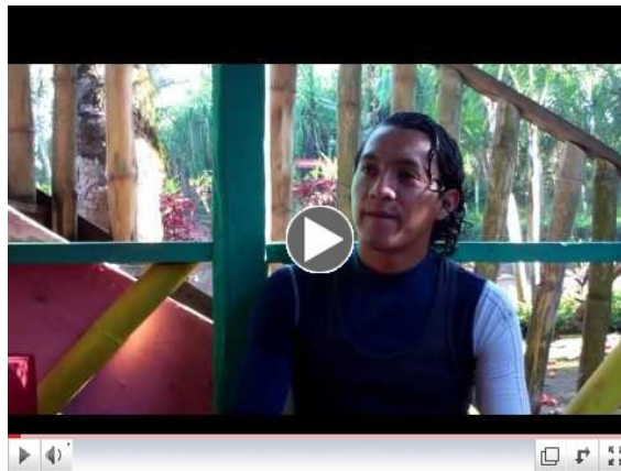
Student from La Flor

"The biggest give a mother can give her children...education."